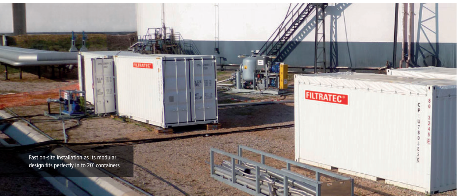
Fast on-site installation as its modular design fits perfectly in to 20' containers